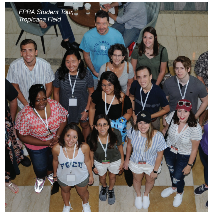
FPRA Student Tour, Tropicana Field

FPRA helps student members secure meaningful internships in a variety of industries from tourism to high tech. You'll have access to the FPRA members-only online Job Bank where you just might find the opportunity that launches your career!