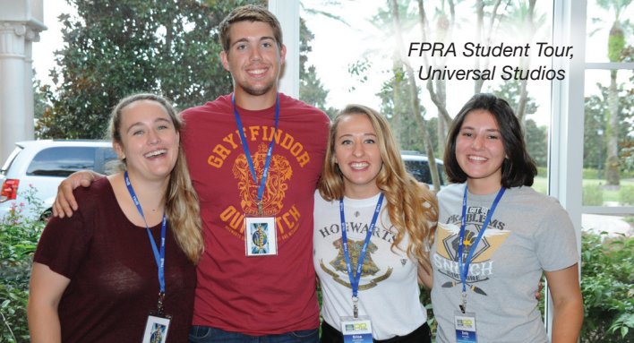
FPRA Student Tour, Universal Studios