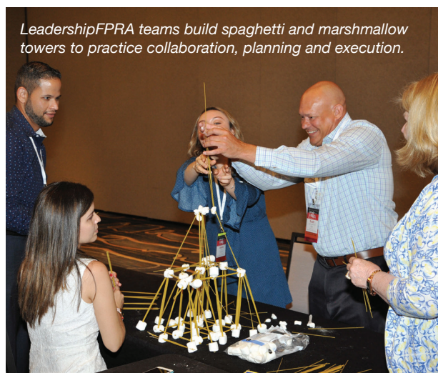
LeadershipFPRA teams build spaghetti and marshmallow towers to practice collaboration, planning and execution.

And with your LeadershipFPRA cohort and faculty comprised of some of the most accomplished PR professionals in the state of Florida, you'll also have unparalleled opportunities to network and form lasting relationships.