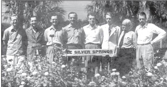
Founding members of the Florida Association of Publicity Directors, 1939